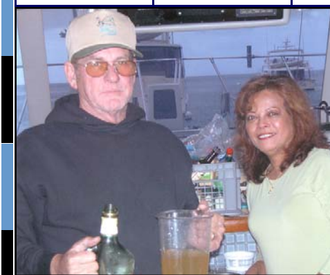
The Margarita King!